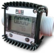
Digital flowmeter K24