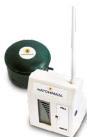
Watchman Sonic Plus leak and level sensor