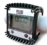
K24 digital flowmeter