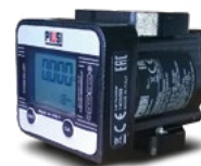
Professional PIUSI K600 digital flowmeter