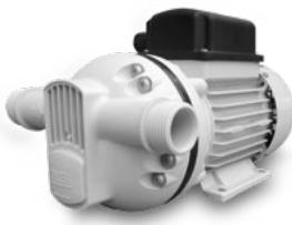
In-line pump 230 AC