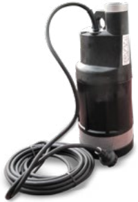
Submersible pump 230 AC